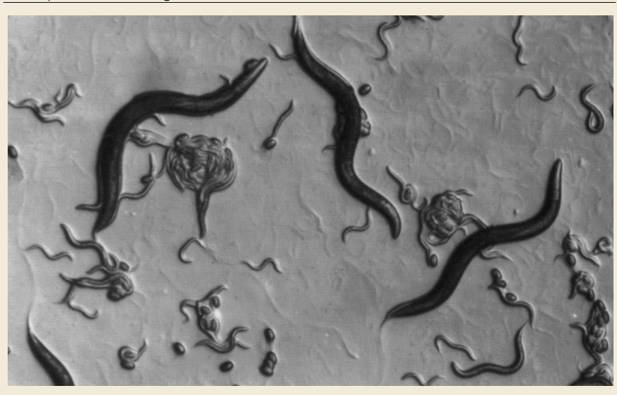
Caenorhabditis elegans is a free-living nematode, ~1 mm in length, with relatively simple behaviours and structures. A complete life cycle takes three days, during which the worm goes through four larval stages. There are two dimorphic sexual forms — a self-fertilizing hermaphrodite and a smaller male, which is rarer and can fertilize hermaphrodites. The sexual forms make inbreeding and the control of genetic types extremely simple. The organism is transparent throughout its life cycle, making observation of its structure and many biological processes possible by microscopy.

in nematodes among the aims of the lab<sup>24,25</sup>. The emphasis on the nervous system at that time revealed Brenner's strong interest in it, as well as his underlying belief that the nervous system was the most elaborately developed system, as it involved not only basic biochemical functions but also more complex mechanisms for the differentiation of neuronal connections and physical structures. The presence of rigidly defined neural connections from individual to individual in invertebrates, and especially in nematodes, indicated to Brenner that such connections might be produced genetically, making the descriptive mapping of the nervous system an ideal way to gain insight more generally into development.