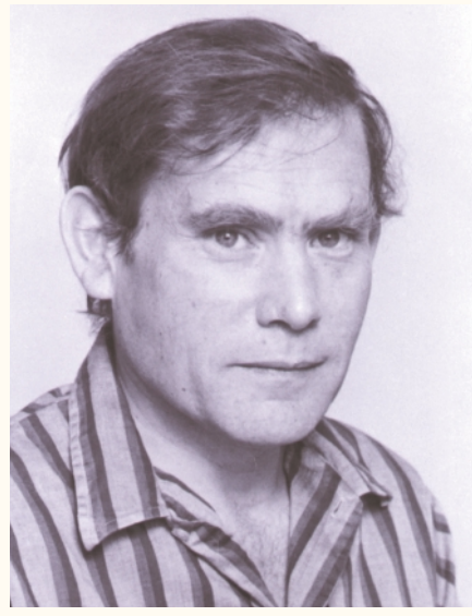
Figure 1 | Sydney Brenner at the Laboratory of Molecular Biology in the 1960s.

biology had achieved and where it might make significant future contributions.