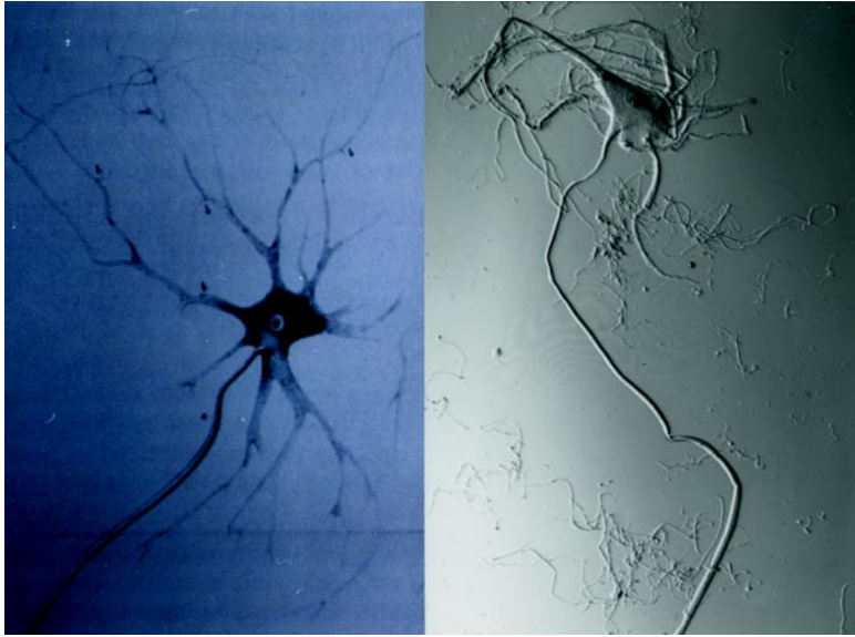
Left, drawing of an isolated neuron by Karl Deiters (reproduced from ref. 19). Right, isolated neuron obtained with the Deiters microdissection technique, using thin needles under the microscope (courtesy of G. Merico). The long axon in both cases does not appear ramified because branchings were disrupted during the procedure.

found a new reaction to demonstrate, even to the blind, the structure of the interstitial stroma of the cerebral cortex. I let the silver nitrate react with pieces of brain hardened in potassium dichromate. I have obtained magnificent results and hope to do even better in the future.” This reaction provided, for the first time, a full view of a single nerve cell and its processes, which could be followed and analysed even when they were at a great distance from the cell body. The great advantage of this technique is that, for reasons that are still unknown, a precipitate of silver chromate randomly stains black only a few cells (usually from 1 to 5%), and completely spares the others, allowing individual elements to emerge from the nervous puzzle.